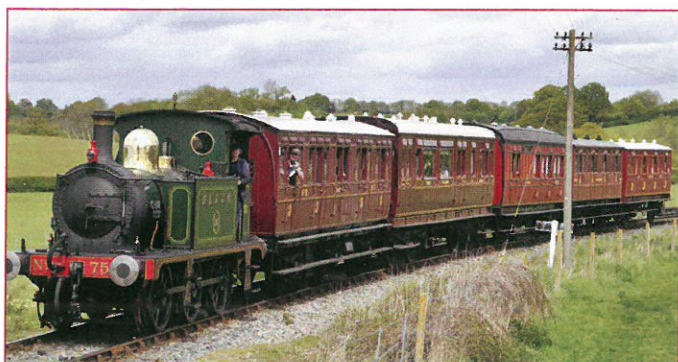
"Steam and tea" in the countryside

We need hosts for this visit both for accommodation for our guests and for showing them around. Time passes quickly. Please volunteer now