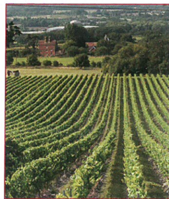
Vineyards on chalk

The owners of Chapel Down claim that coupled with a cool climate they are able to produce world class sparkling wines. We're sure our German visitors will put them to the test.