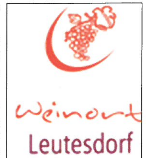
Top, overlooking the Rhine, the Drachenfels; above, the logo of the Leutesdorf wine village near Neuwied

We will be joining up with them and our hosts for a social on the Sunday evening.