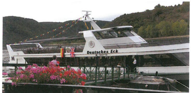
Our Rhine trip boat, Deutsches Eck (German Corner)