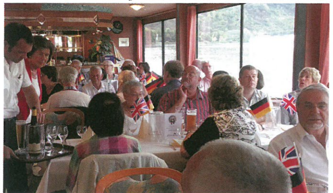
Watching the Rhine go by as we enjoy a fine meal